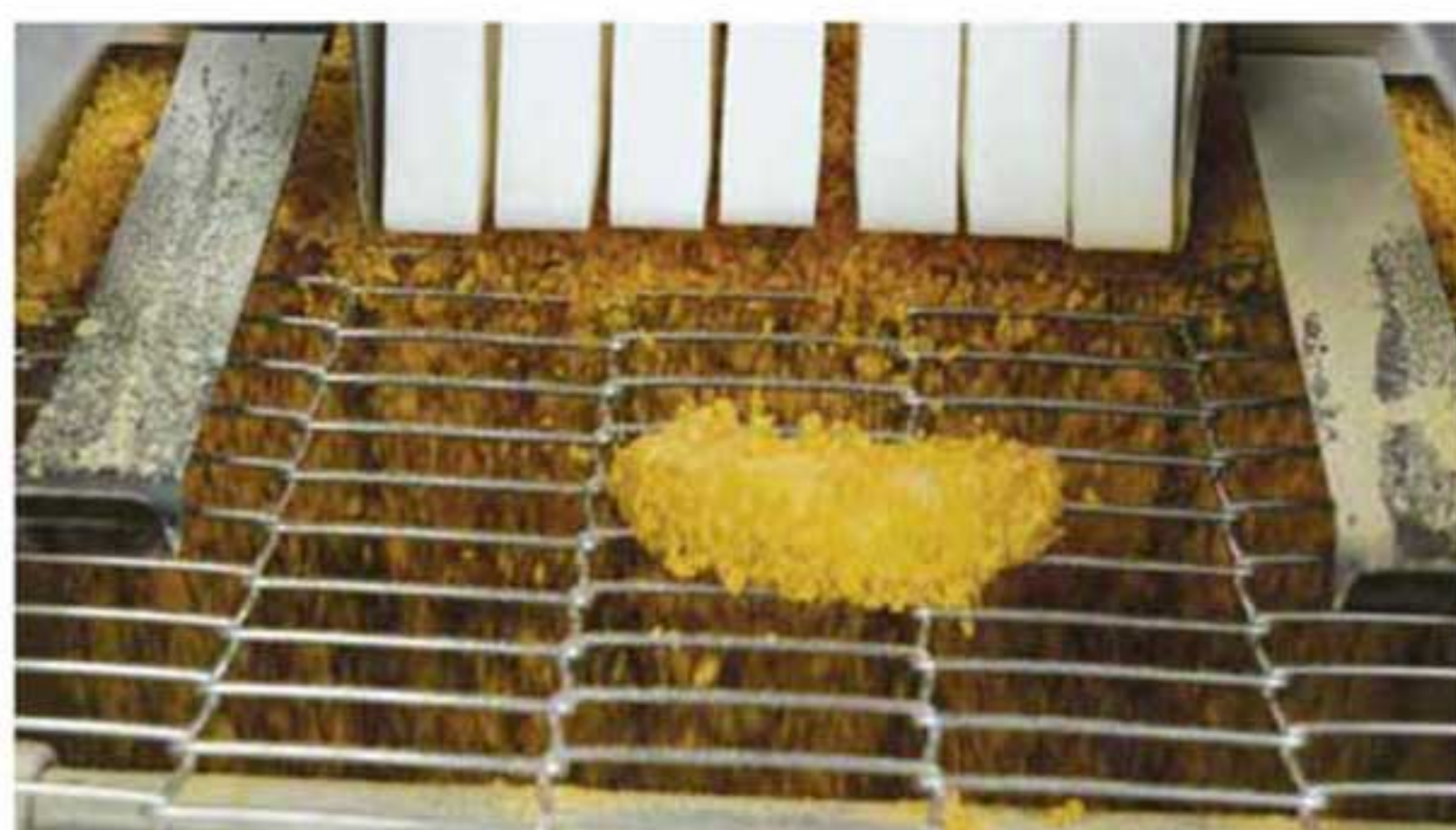
Good Vibrations – Vibrator springs shake off excess coating, saving on the cost of ingredients and extending fryer oil life.