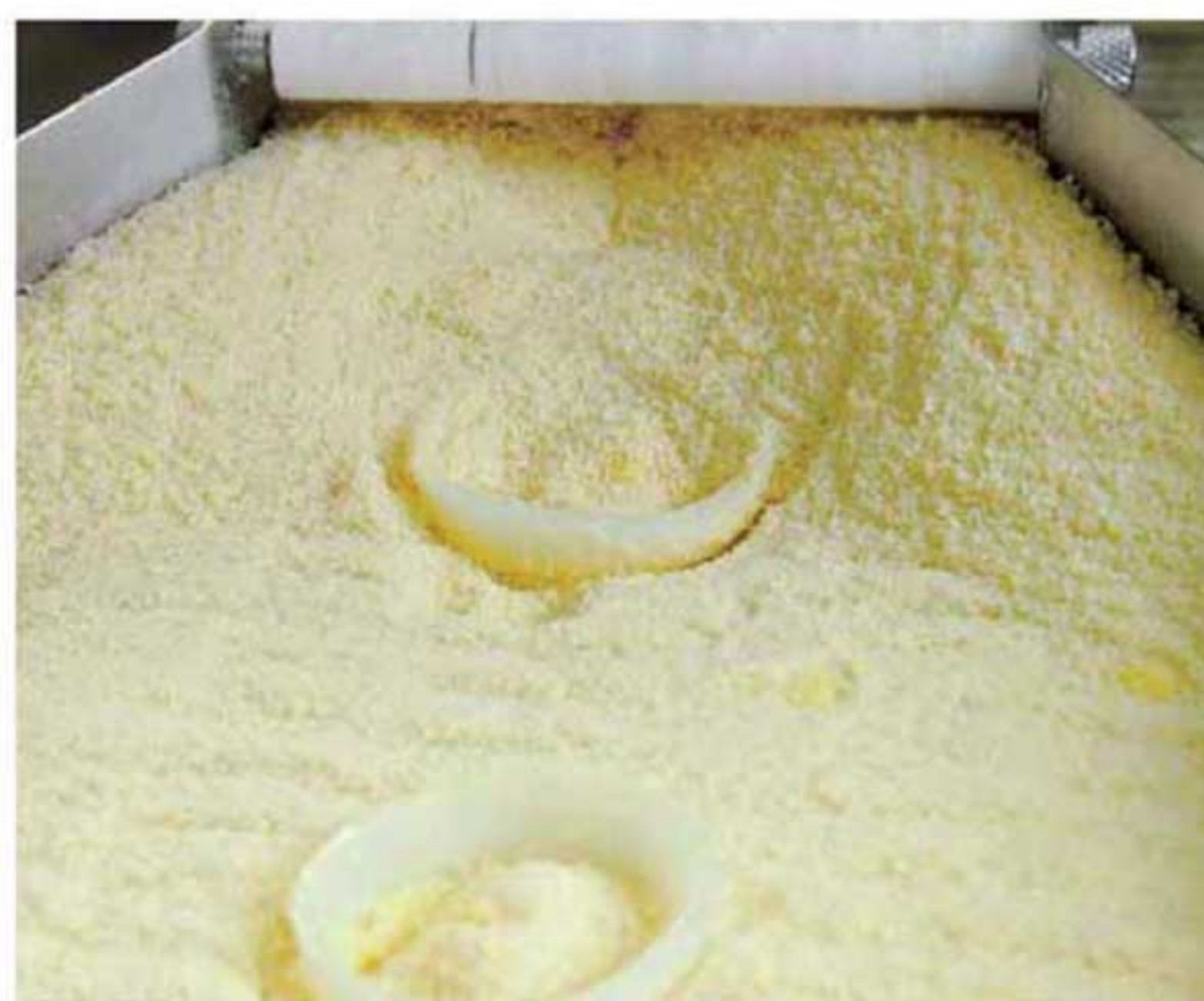
Consistency – Battered items are completely and evenly coated.

What’s more, the Bettcher ACS delivers high-capacity breading production in a small equipment footprint of only 17” x 22”.