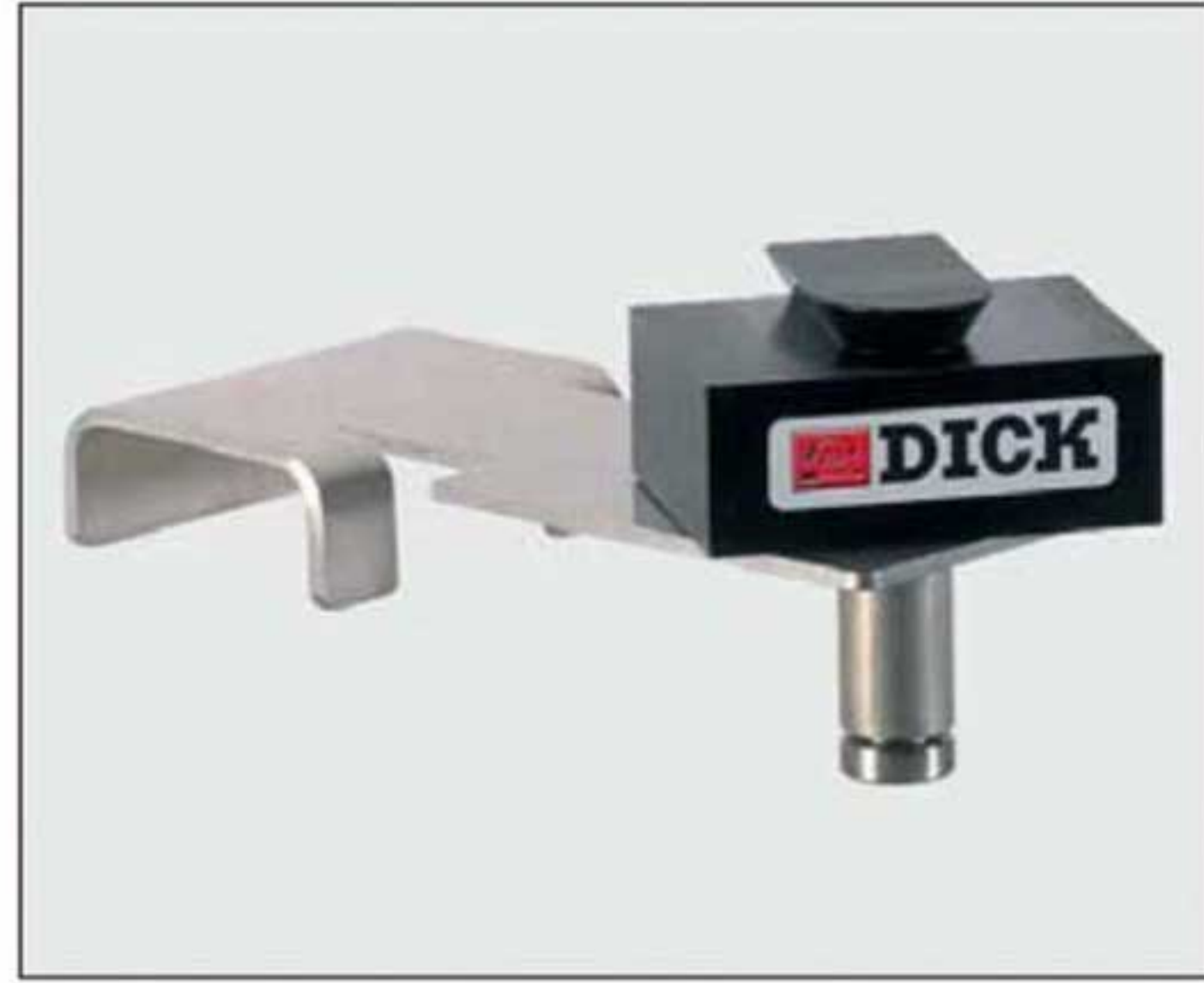
Accessory: Holder for fastening at the work place Prod. No. 9008102