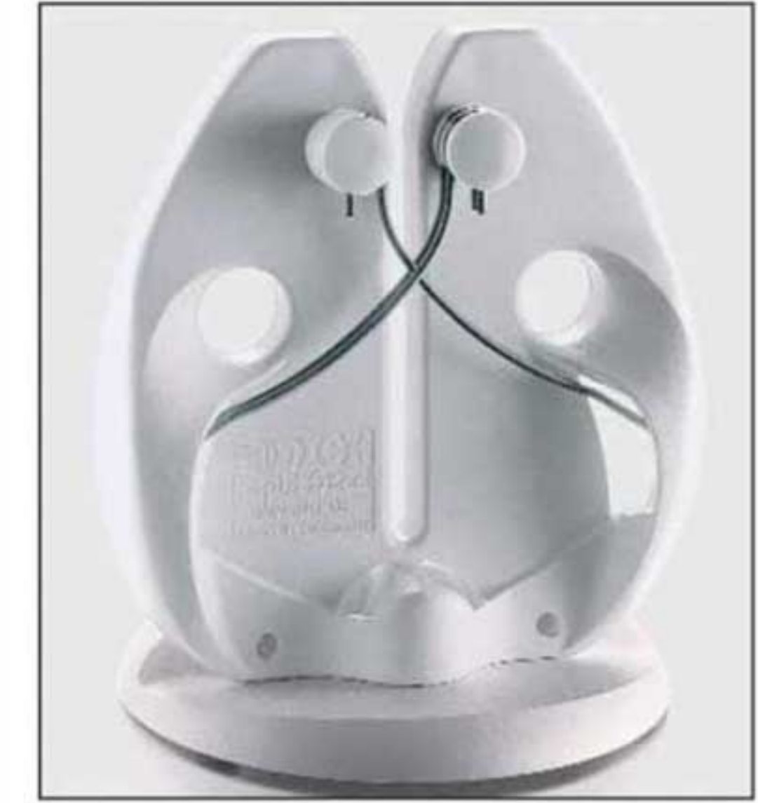
Accessory: Stand Prod. No. 9008106-05