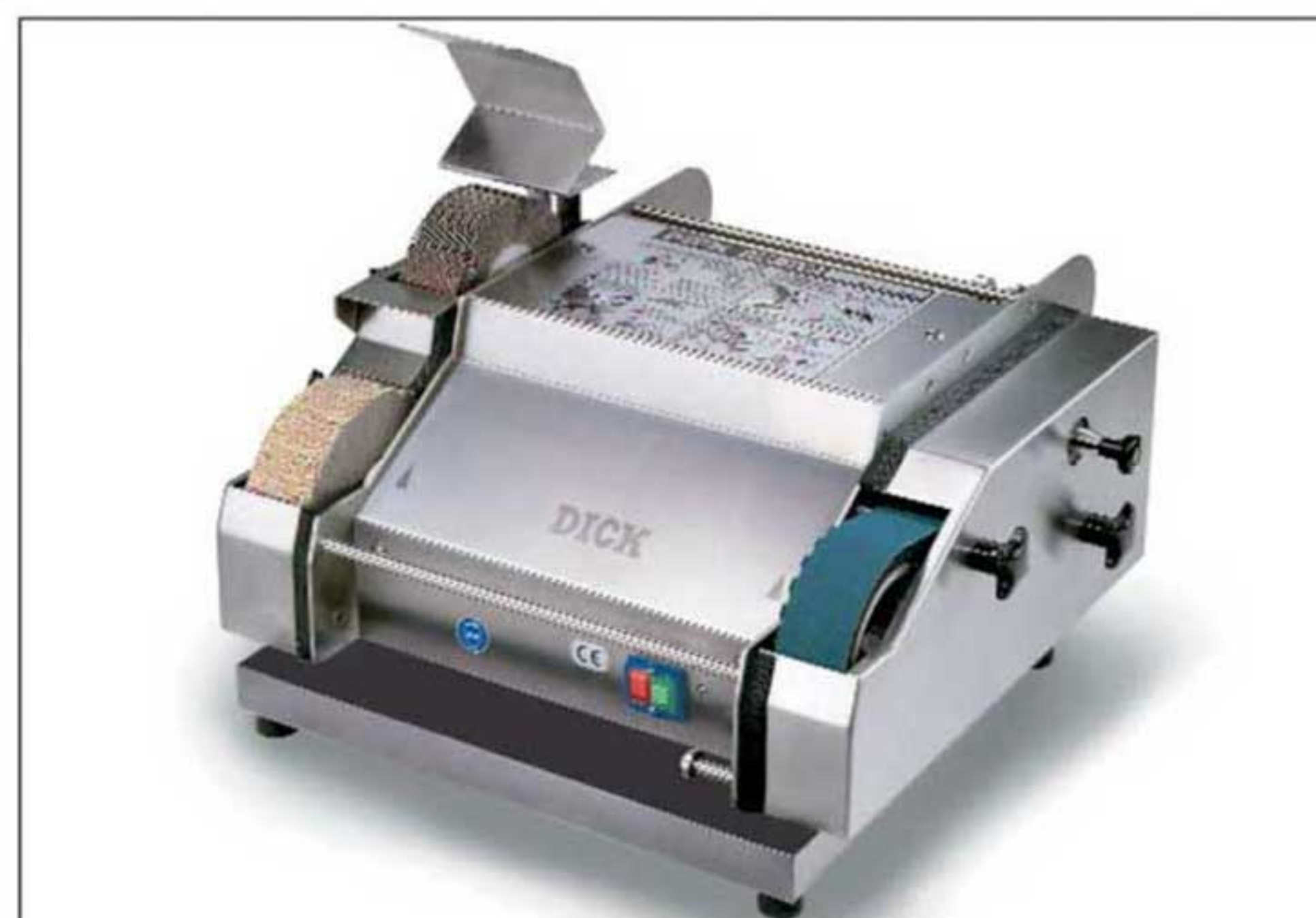
Universal Grinding Machine DICK SM-160 T