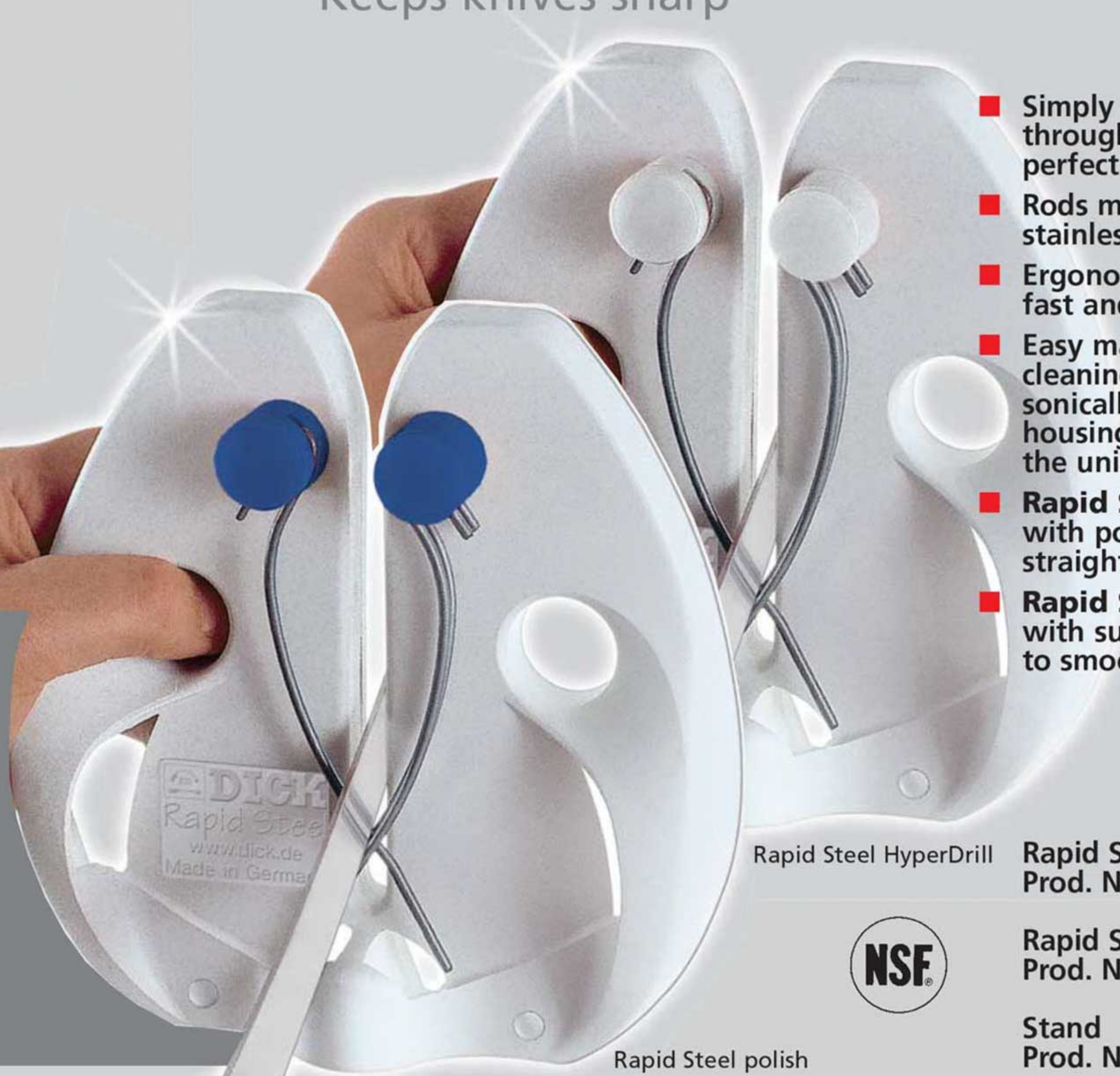
Rapid Steel HyperDrill