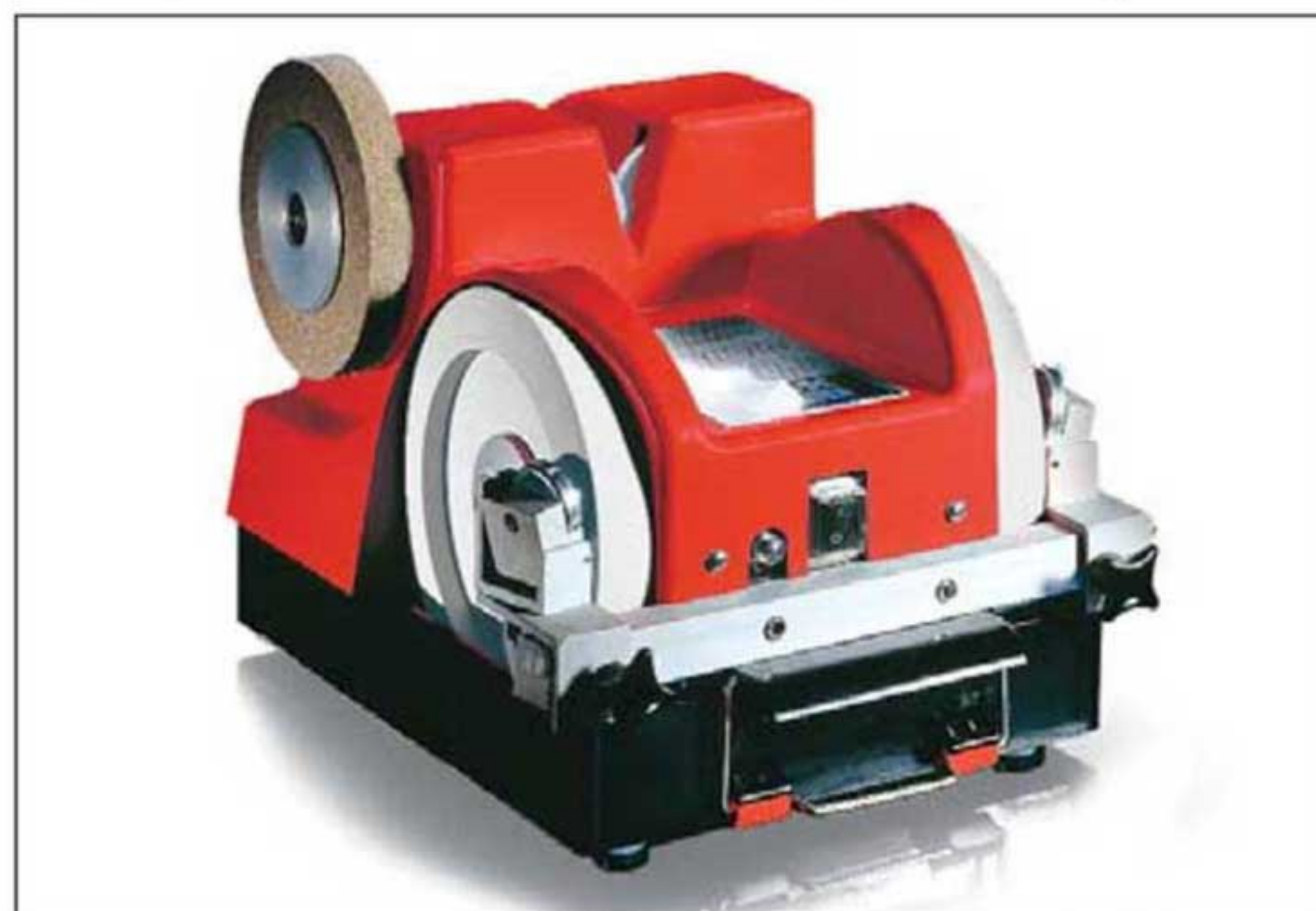
Grinding-, Honing- and Polishing Machine DICK SM-111

As leading knife manufacturer DICK is certainly competent regarding the sharpening of all types of knives. There are many different requirements for how a knife blade can be ground. DICK offers individual solutions e. g. for butchers and the meat processing industry.