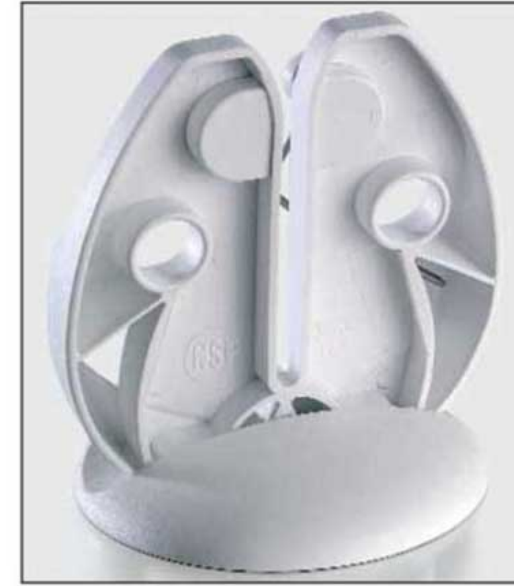
Hygienic, ultrasonically-sealed spring housing