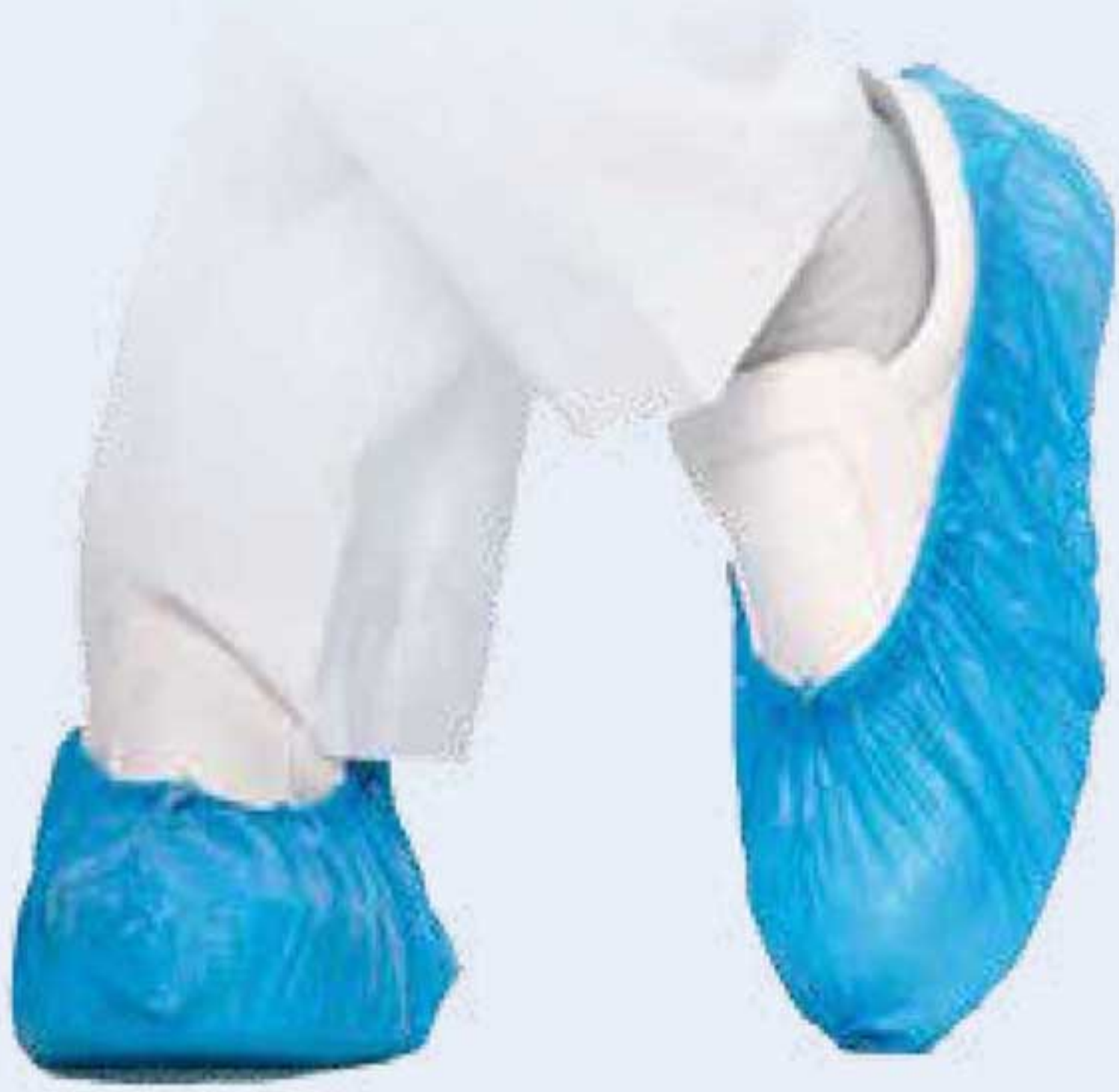
Overshoe CPE for HYGOMAT