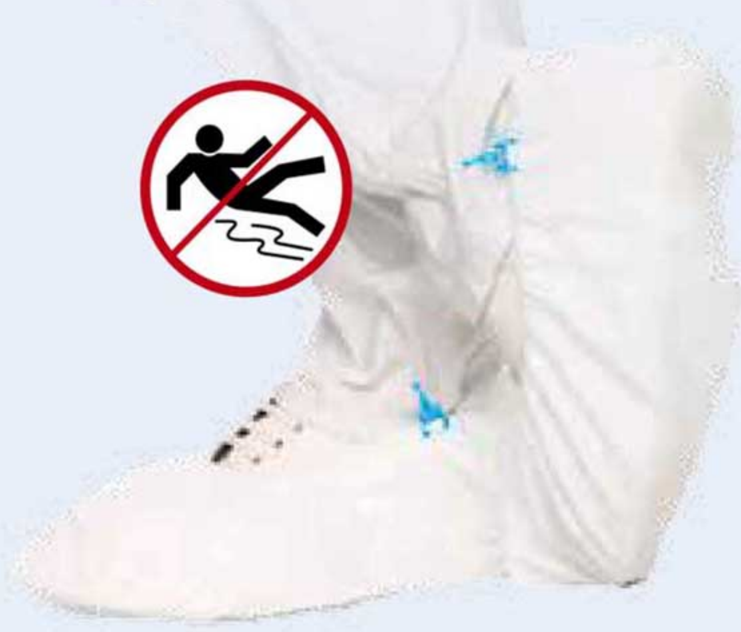
Nonwoven overshoe with CPE coating for HYGOMAT