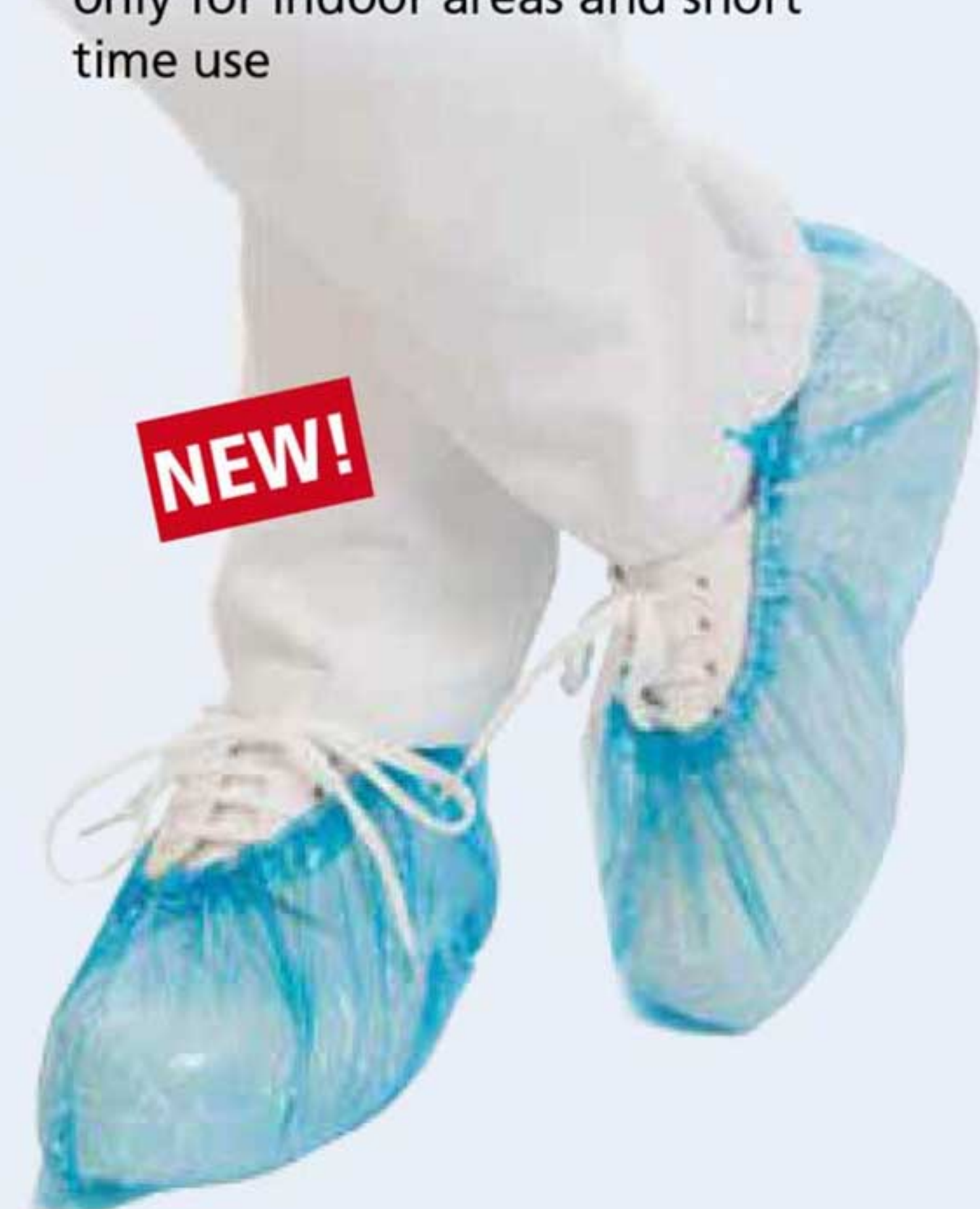
Overshoe ECONOMY for HYGOMAT