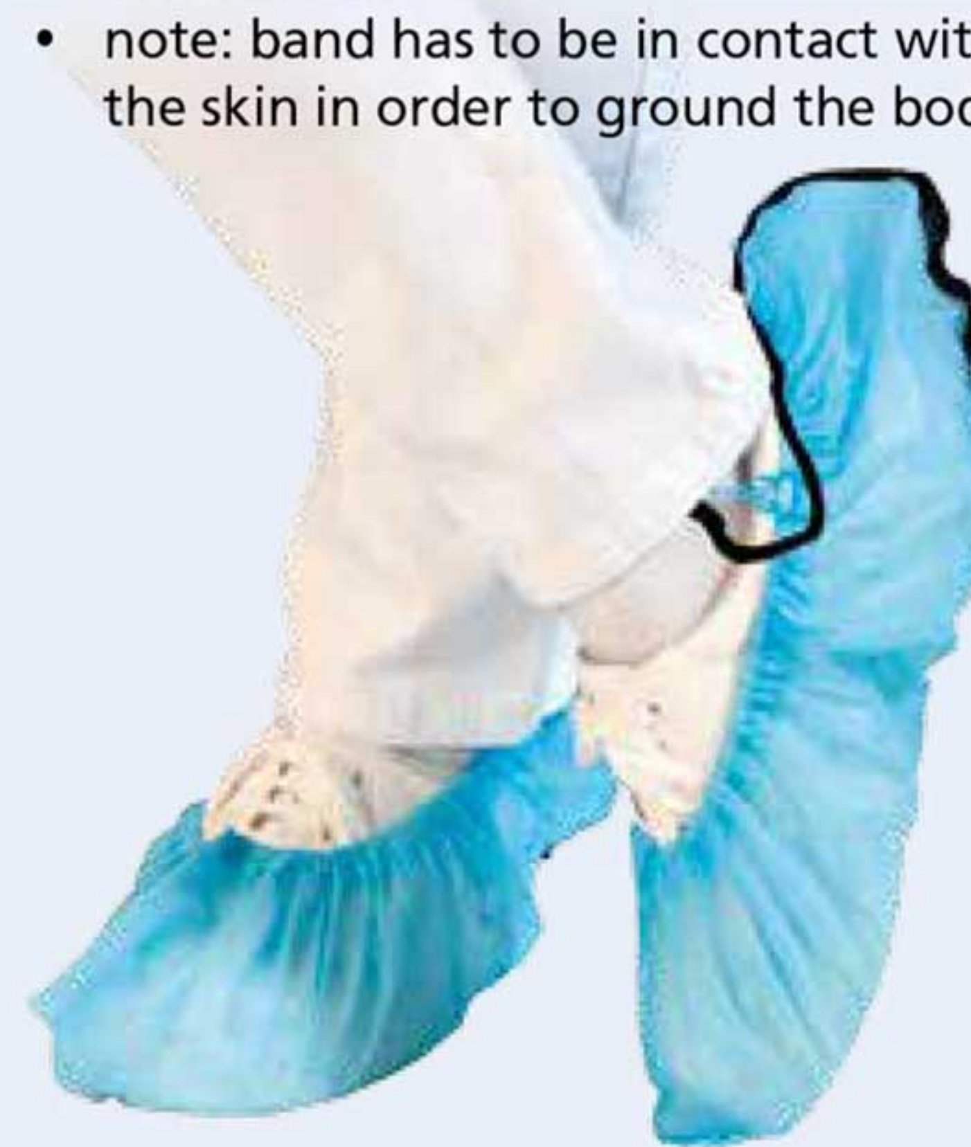
PP overshoe with antistatic band for HYGOMAT