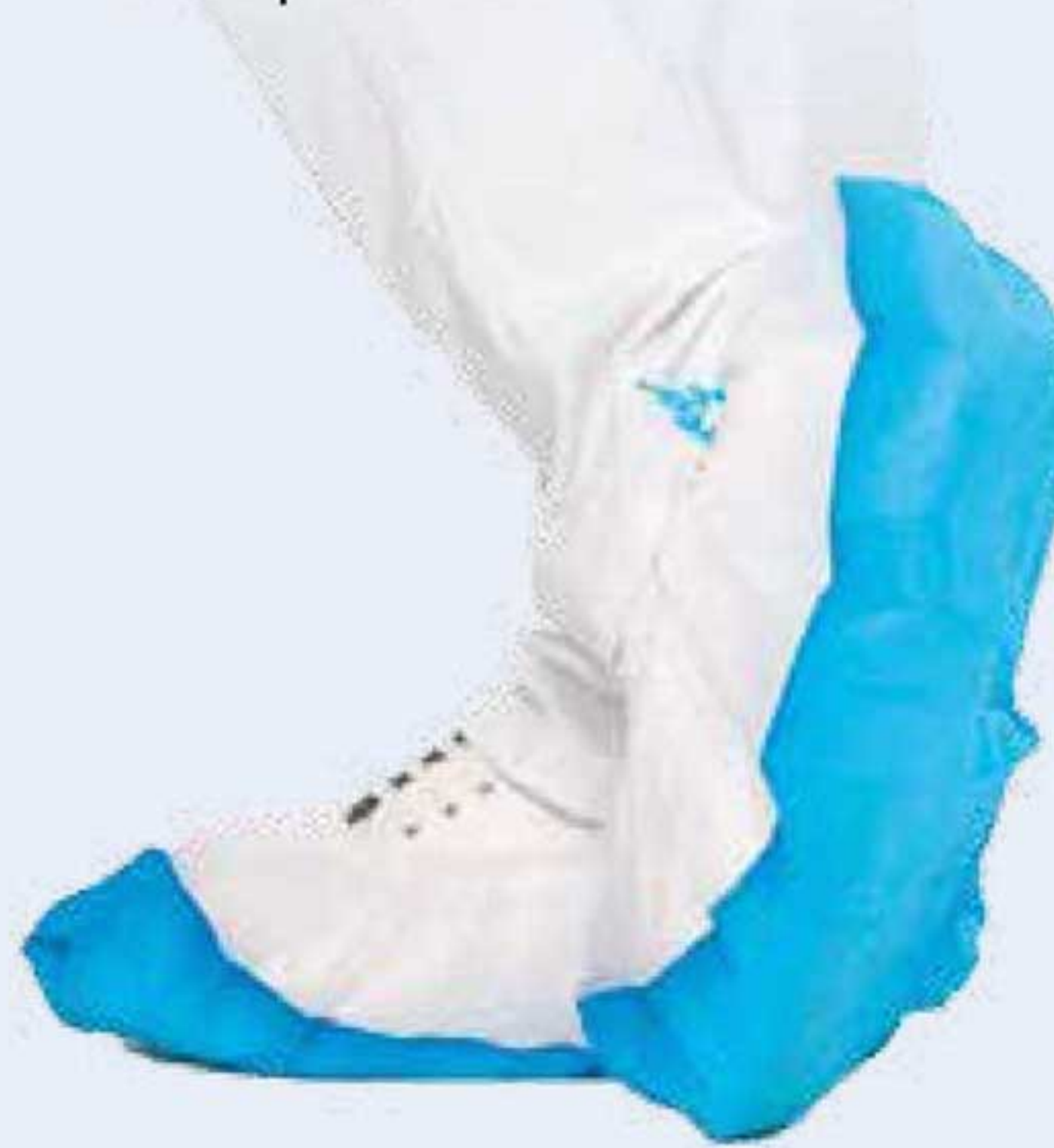
Overshoe with strong CPE sole for HYGOMAT