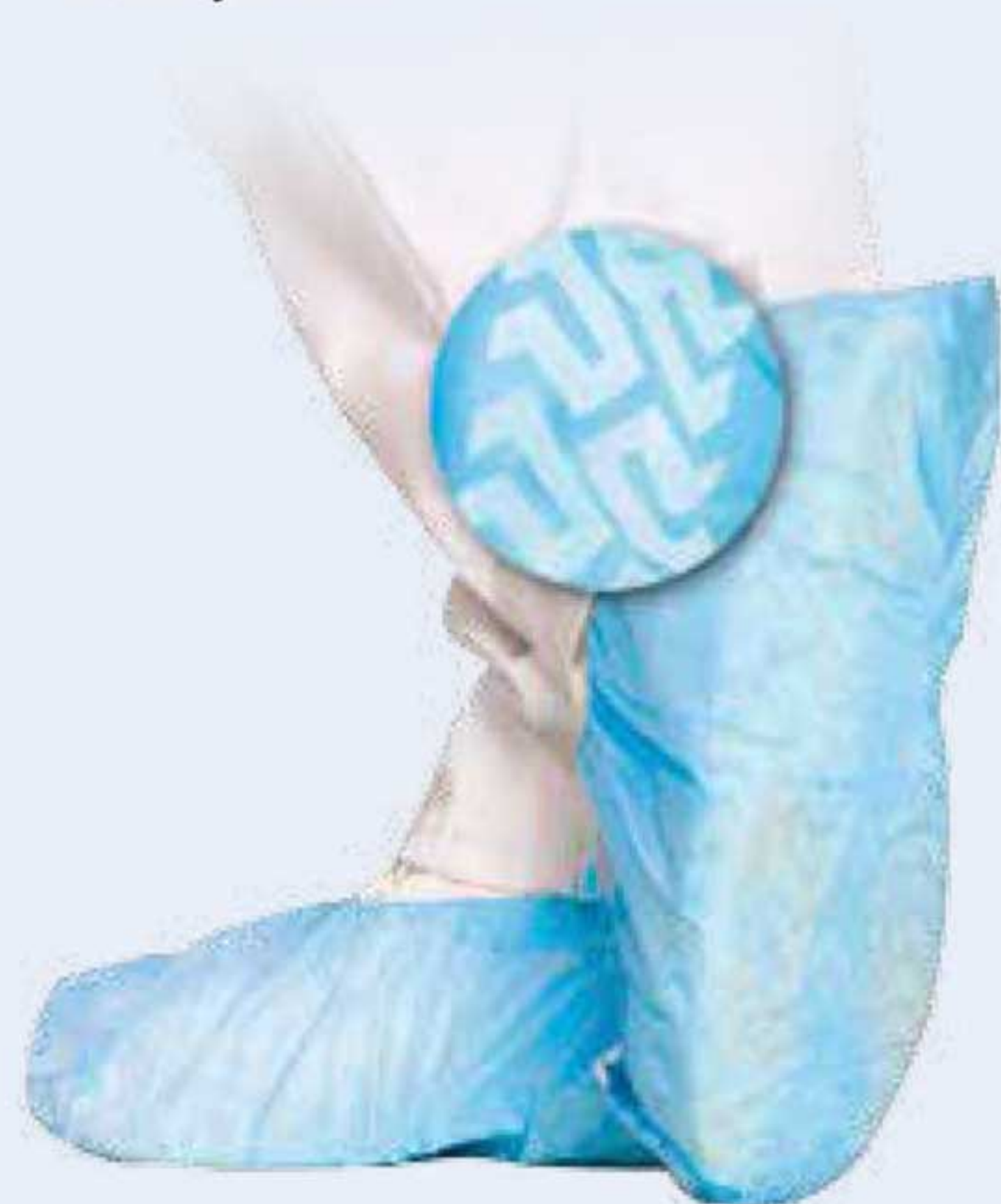
PP overshoe with structured sole for HYGOMAT