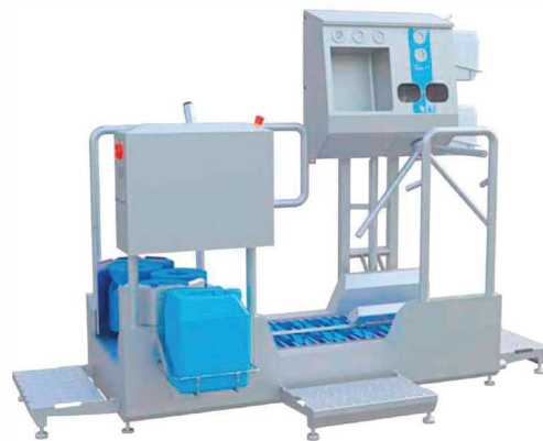
Walk-through boot cleaning machine type 23830-1000 with Inlet Complete