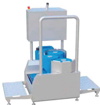
Walk-through boot cleaning machine type 23830