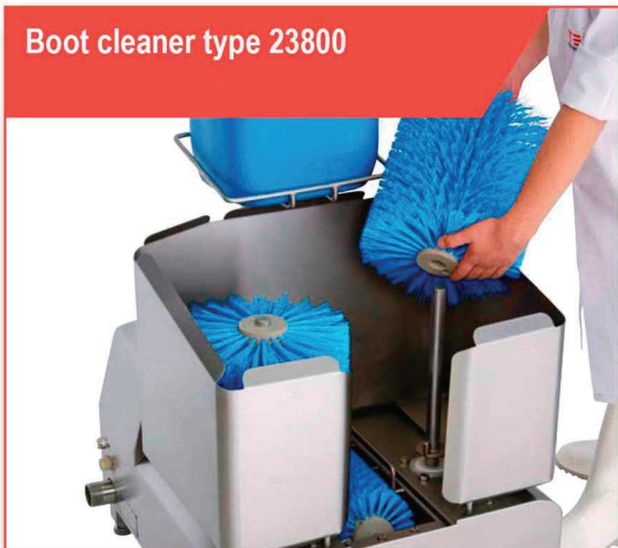
Boot cleaner type 23800